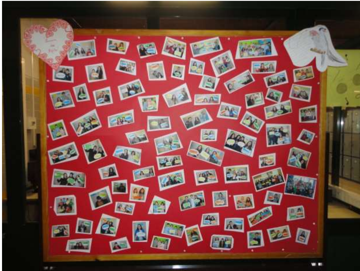
Affective Messages in Portuguese, English and Spanish.